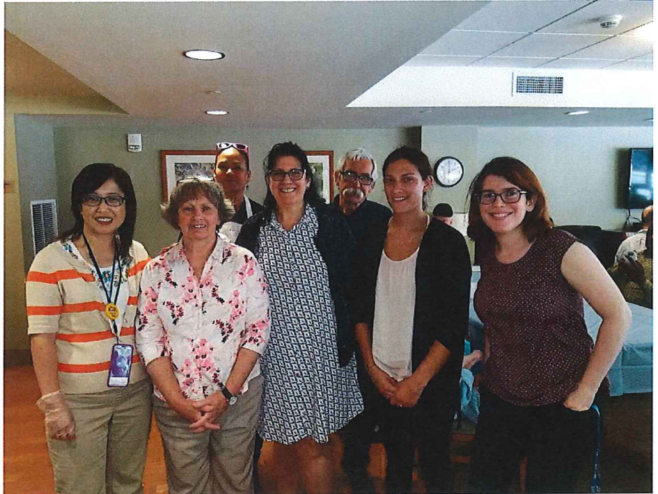
Boston Senior Home Care Staff Assisting with Serving the Meal

Residents do much more than receive a home-cooked meal; they get out of their apartments and connect to other vital services that the NE/WE NSC offers, such as assistance to receive food, health insurance, and help with paying for utilities and rent as needed. The lunches often include guest speakers, such as elected officials or community-based organizations. The meal is an equalizer as both clients, NE/WE NSC staff and volunteers, and Blackstone staff socialize with one another, talking about movies, the neighborhood, who is having a birthday, and so on.